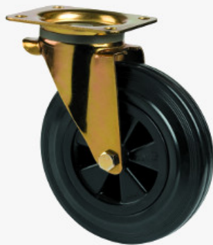
With Directional Lock