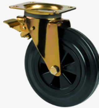
With U Lock