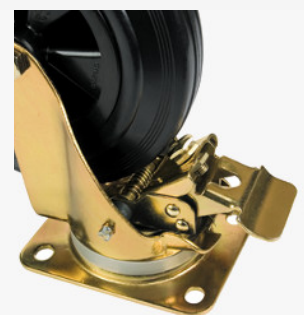
With Screw Lock